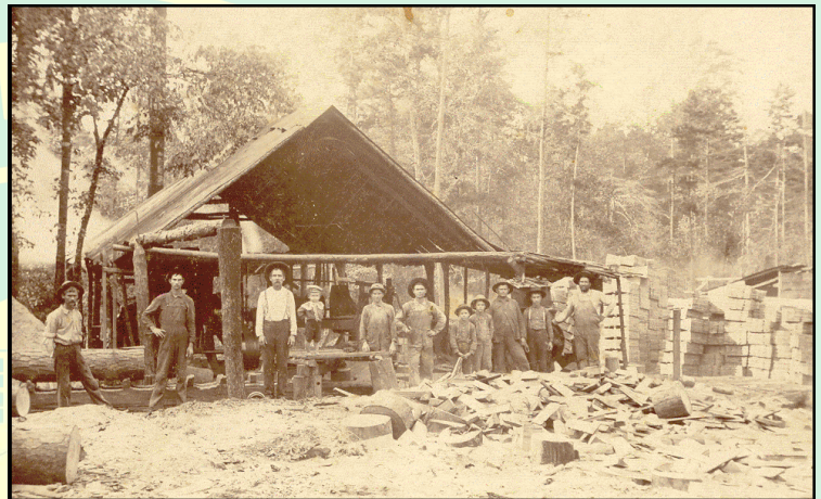
Early sawmill

The ultimate destination of logs moved by rail was, of course, the sawmill, where the logs were cut into boards or other shapes that might be needed. The sawmill evolved over time, as steam power and electricity became available, both of which improved productivity of a sawmill. Sawmills in the early 1900s were composed of a sawmill building, which is where the actual sawing was done, an office or general-purpose building, a mill pond, the railroad line, and the drying area. (6) Interestingly, logs being stored temporarily to await movement into the sawmill, the logs were better preserved in the water. (7)