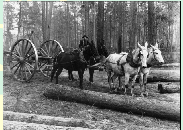
Mule team with log skid

For those who lived near rivers, and the river was located at or near a place where they wanted to deliver the timber, floating the logs down the river was one option. However, animal power had to be used to get the cut timber from the forest to the river, and the whole system was not very efficient. Settlers then turned exclusively to animal power, but this was not ideal either. The weight of the timber was such that animals could not pull it for long distances, because many of the roads over which they traveled were rough, with moderate grades that added to the strain on the animals. (2)