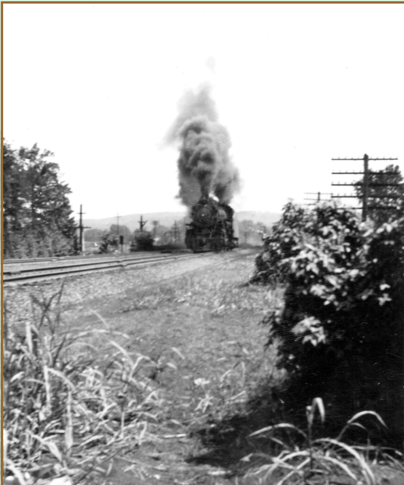
Making the grade at Irondale — A well-framed vertical photograph can convey a sense of drama, as evidenced by this photo of a Southern Railway freight pulling the grade out of Irondale, Alabama en route to Birmingham's Finley Yard. Mid-South member Matt Lawson was there to capture the action in the late 1940s during the final days of Southern steam.