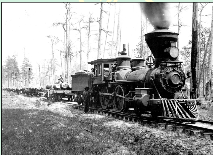
Early Florida logging railroad

As with many things in life, the development and application of steam power in the nineteenth century revolutionized the viability of the logging industry. Steam-powered machinery aided the handling and loading of logs onto rail cars. And, steam locomotives finally provided sufficient power for moving the logs by rail to the sawmill. (3)