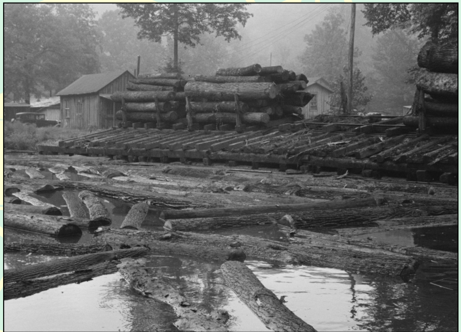
Sawmill in Erwin, West Virginia circa 1938

Generally speaking, a sawmill, large or small, has four components: the sawmill buildings, a mill pond, railroad tracks that connect the logging railroad and the pond, along with yards and kilns for drying the wood. Logs are stored in a pond when they arrive at the mill because the water prevents the wood from drying out, and also facilitates movement of the logs into the mill. In addition, insects cannot infiltrate the log while it is wet. When logs arrive at the mill, some made use of "dry" storage, instead of storing them in the pond to keep the logs wet. This is particularly true if it's relatively easy to maintain a steady supply of logs, minimizing the storage space needs for logs waiting to be cut, if the sawmill is relatively small, or if the sawmill is primarily processing hardwoods.