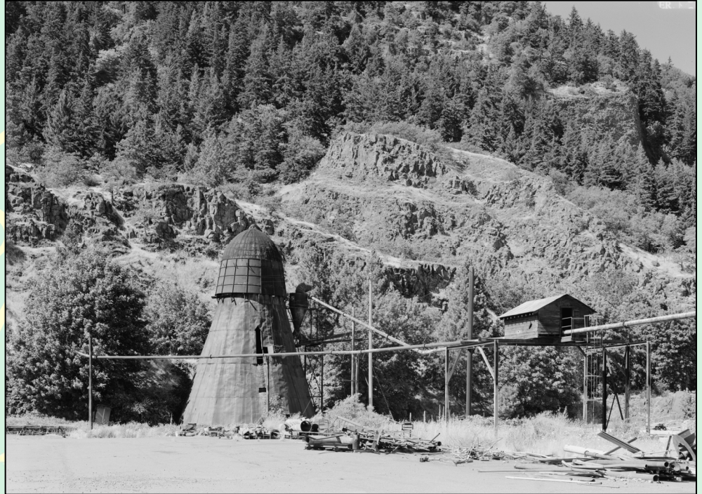
Sawdust burner near the Columbia River in Washington State

While the logging boom began in Laurel in 1880, by 1930, most of the timber in the area had been depleted, and the sawmills were doing very little business. There were four key mills that dominated the lumber industry in Laurel during this time – the Eastman, Gardiner & Company, the Gilchrist-Fordney Company, the Wausau Southern Lumber Company, and the Marathon Lumber Company. The logging boom brought tremendous economic benefits to the owners, who were all northerners, as well as the workers, most of whom had been hired locally in Laurel. The tragedy of this period was that there was no forest management or conservation in place during this time, and once the boom was over, Laurel experienced significant economic decline. Fortunately, other businesses developed in Laurel over the years, and today it's a charming southern town of approximately 20,000 people. And, Laurel is served twice daily by the northbound and southbound Amtrak Crescent , which operates between New York and New Orleans, mostly on Norfolk Southern's line between Washington, D.C. and New Orleans.