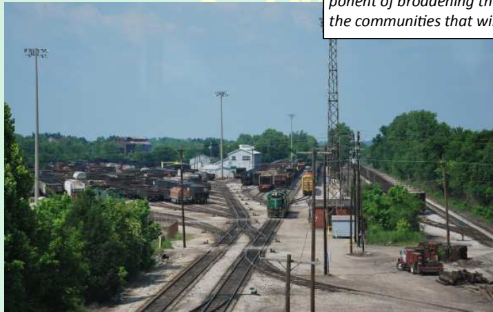
During a driving tour of the Birmingham district, attendees caught a glimpse of the new Birmingham Terminal (formerly Birmingham Southern) yard at Fairfield

“I especially found it interesting that we spent as much time on the various industries related to making steel as we did on railroading in the area. That community-wide integration is, I believe, an important component of broadening the appeal of railway heritage for future generations, and for the communities that will sustain some part of their economic wellbeing from railway