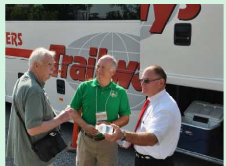
A bottle of refreshing ice water never tasted so good after a walk in Railroad Park!