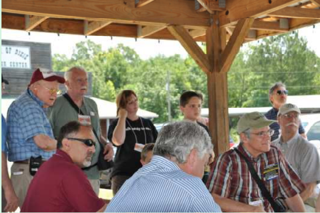
Did someone say “time for lunch?!?” A hungry crowd eagerly awaits arrival of the barbecue chuck wagon at the Heart of Dixie Museum

Mid-South Chapter hosts the Annual R&LHS Meeting in May