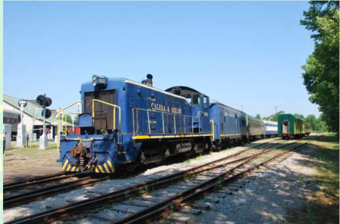
The Heart of Dixie Railroad Museum hosted an excursion over the former L&N Alabama Mineral line from Calera, Alabama