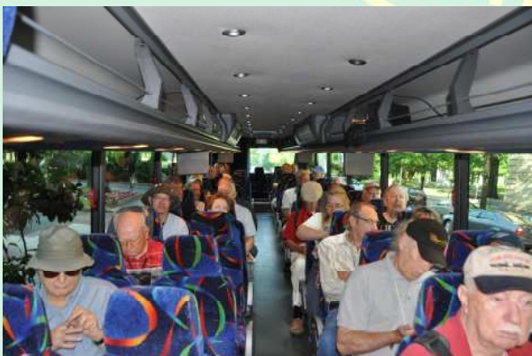
Honestly, fellas, isn't it a little early for a bus ride?