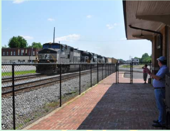
Gosh, it's a TRAIN! A northbound AGS freight passes by during a visit to the Bessemer Hall of History. As the train gods would have it, only a few main line trains were spotted during the convention tours.

Mid-South Chapter hosts the Annual R&LHS Meeting in May