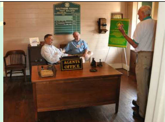
What better way to end the day than a gab session in around the agent's desk at Leeds depot, Mid-South HQ