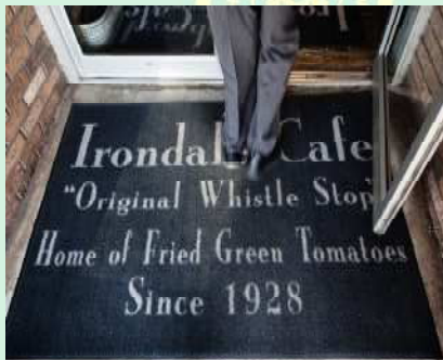
Attendees enjoyed a delicious lunch at the Ironton Café of “Fried Green Tomatoes” fame