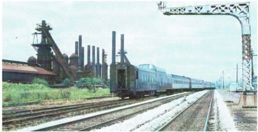
ABOVE: "On arrival at Birmingham, we reversed the procedure at 'The Puzzles' as I backed the train into Terminal Station . . ." Southern train 2, from New Orleans, shoves across the puzzle switches as it backs into Birmingham's Terminal Station in 1976. On this trip, Southern's coach-dome, 1613, is on the rear. Dormant Sloss-Sheffield iron mill is at left.

Imagine everyone's surprise in the crew room that morning when they realized I had gold buttons on my uniform!