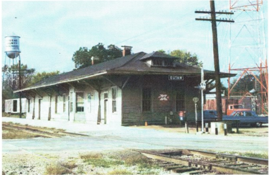
"We also stopped at Eutaw, Ala., which was a flagstop . . ." The Eutaw depot in October 1969.

Today it was "highball the box." Not long after passing the detector, there was a loud whoosh of air, and the brakes were applied in emergency. I noticed the brake valve for the backup hose was still there on the scissors gate, but where was the air hose? Sure enough, the air hose had separated from the valve, and we were in emergency at 79 m.p.h. The train glided to a stop and I got down and closed the angle cock. Bubba was looking back from his normal post