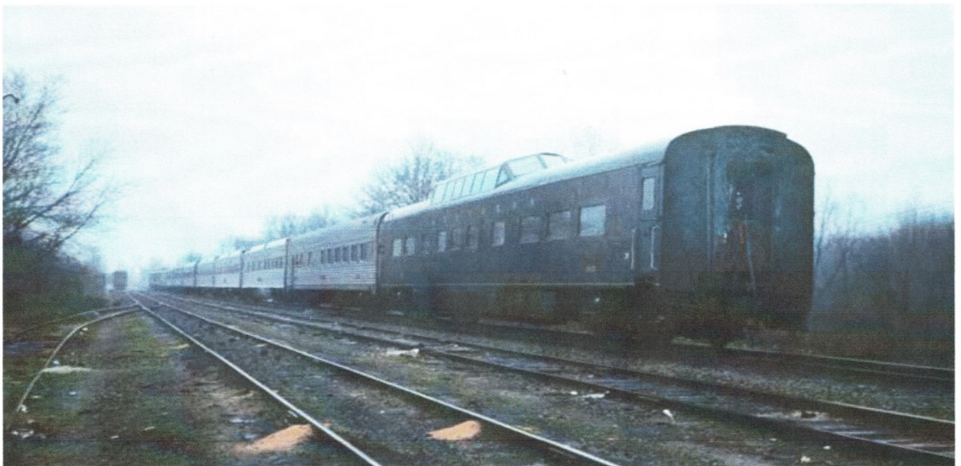
"I was positioned in the rear vestibule of the last car (the parlor-dome car) . . ." Train 1 has a high green at the GM&O crossing as it pulls away from Tuscaloosa, Ala., on a cold, rainy Jan. 7, 1973. The parlor-dome car is the same one (SOU

crew in Meridian, Miss. (so called because they worked the territory of predecessor New Orleans & Northeastern between Meridian and the Crescent City). I told the flagmen that the monkey tail had blown off enroute and all that was left was the valve. He had a fit, even though there were two spares hanging just feet from where we were standing. He needed the monkey tail to back into