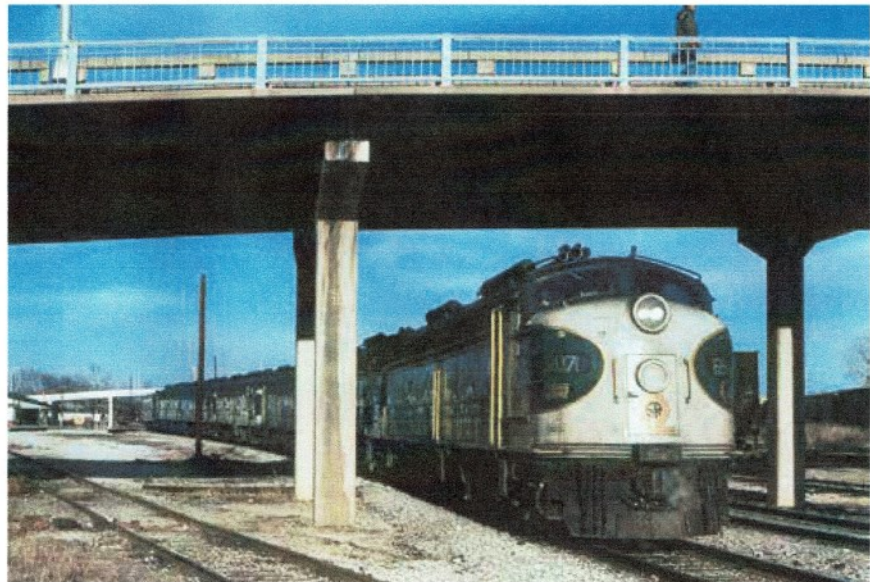
"We swapped out with the 'Northeastern' crew in Meridian, Miss." E8 6907 pauses under the 22nd Street Viaduct in Meridian as it makes the station stop with the final southbound Southern Crescent , on the afternoon of Thursday, Feb. 1, 1979. The next train to stop here will be the northbound Amtrak Crescent , Southern train 820, on Feb. 2. Old Meridian station is white structure at left. Note that train 1 has six E8s on the head end; under Amtrak operation, the train will run daily, with three E8s (instead of four), so an extra set of power is on the way to New Orleans to cover Feb. 3's Crescent departure.

After a nice breakfast the following morning at Wideman's Restaurant in Meridian, we headed north on No. 2. The trip was uneventful, except for one passenger. I was walking