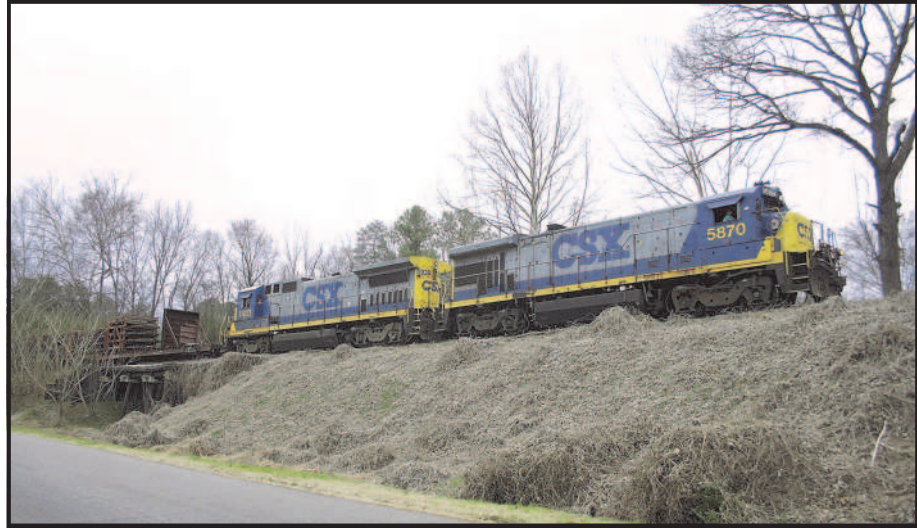
It's 3:15 Sunday afternoon as CSX #5870 leads the final pull of the day as it crosses a small stream at Black Creek park in Fulntondale.

not clear what will become of the Cane Creek right-of-way into Flat Top. This portion includes a beautiful curved trestle and bridge over Five Mile creek and a tunnel just west the Five Mile creek. Where this plan stands today is unclear. There is so much to tell, and perhaps we can revisit this topic in more detail at another time. But for now, we bid the Cane Creek branch a sad farewell.