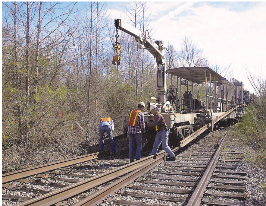
At Mineral Springs, the rail for this “pull” is being cut and will be attached to the end of the previous pull that is extending from the rear of the rail train. The hoist, on the end of the car will be used to lift and align the rails. Holes have been burned into the web of the rails so joint bars can be used to join the rails.