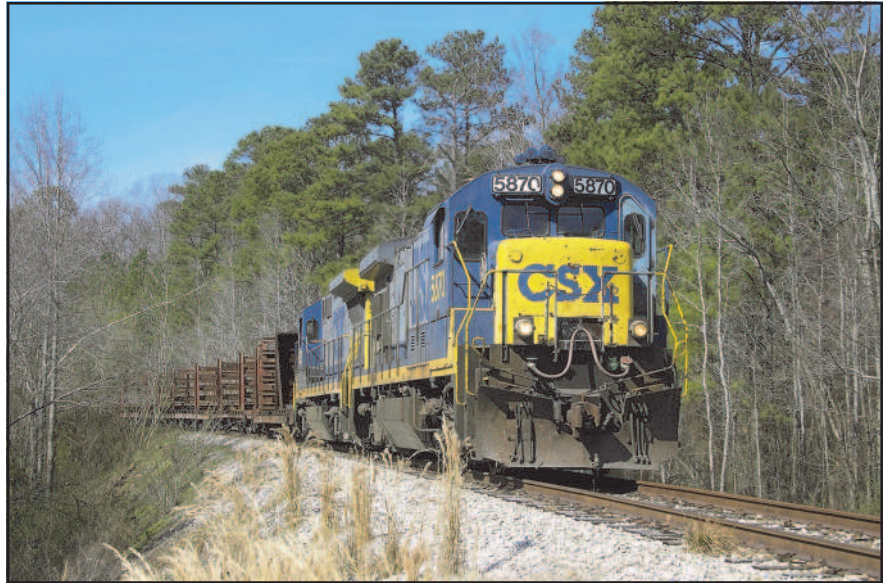
The last train on the Cane Creek branch, leased CSX locomotives 5870, a B36-7, and 5933, a B40-8, creep toward Fieldstown road with an A&K Railroad Materials rail train as it “pulls” two more 1800-foot sections of rail. The rail train arrived the previous day to begin removing the second train load of rail. This “pull” began just west of Watson, a little over 7 miles east of West Jefferson, where the rail salvaging began. The rail train can load rail from about 7.4 miles of track.

I guess we all knew this historic piece of railroad could not survive without revenue producing customers. In the years after 1999, the processing facilities at Flat Top and Bessie were dismantled, and in 2003 the dismantling of the Chitopa tipple was finally completed. Also in 2003, the construction of Corridor X, a new Birmingham to Memphis expressway, brought about the abandonment of a one and one-half mile portion of the Jefferson Warrior Railroad from Flat Top road to West Jefferson, where it joined the Cane Creek branch. Then, in September of 2004, we noticed that the Cane Creek branch right of way was being cleared of vegetation. In February of 2005 the end came for the Cane Creek branch as A&K Railroad Materials began