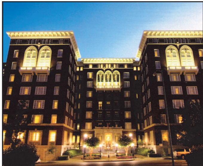
The Tutwiler Hotel, site of the 2012 R&LHS Annual Meeting